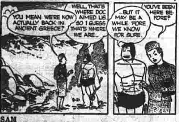
BY AL CAPP and BOB LUBBERS