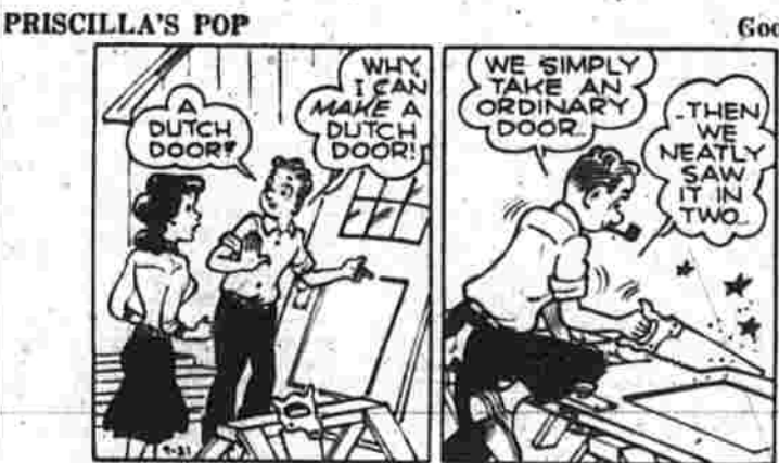
BY AL VERMEER