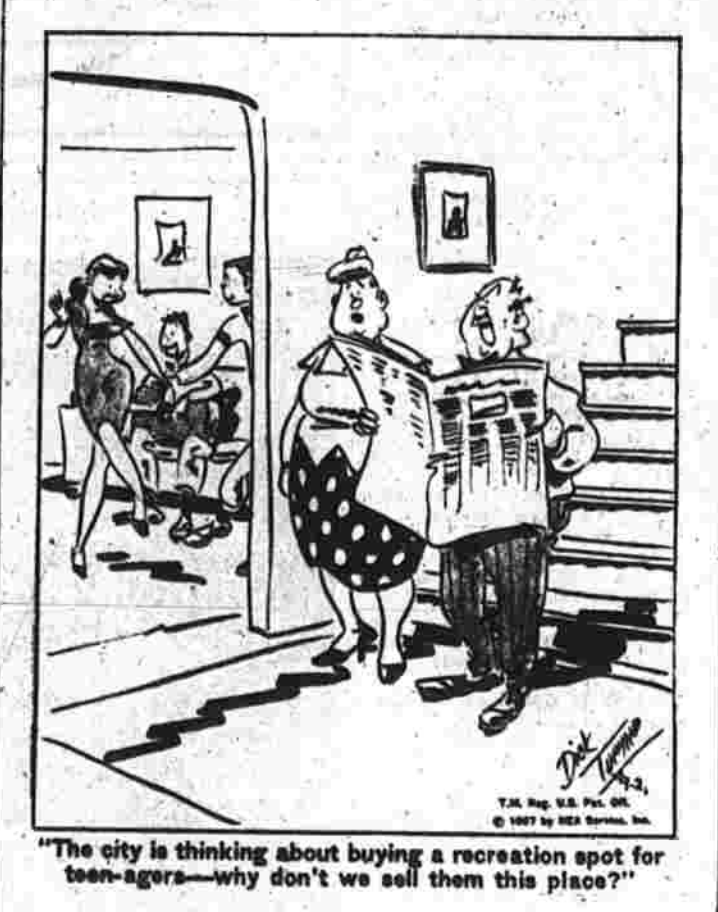
The city is thinking about buying a recreation spot for teen-agers—why don't we sell them this place?